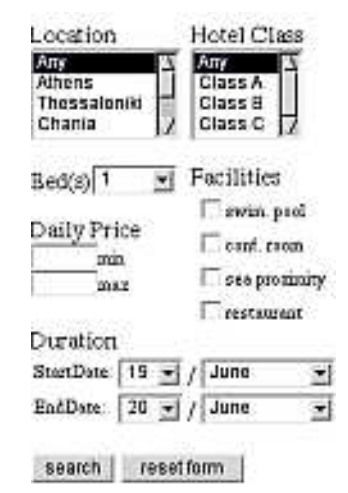
Figure 4. The HyperHotel GUI

The HyperHotel is a data integration application, bringing together the vast amounts of information available online by real-world hotels. Users have the ability to search for their residence-of-choice in multiple e-hotels, without having to visit the web sites of each and every one of them.