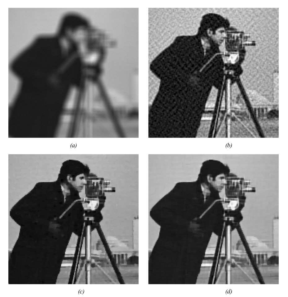
Fig. 1. (a) Degraded "Cameraman" image by uniform 9 \times 9 blur and noise with BSNR = 40 dB, (b) restored image using a stationary Gaussian prior [3] ISNR = 4.57 dB, (c) restored image using TV-TE ISNR = 9.07 dB, (d) restored image using proposed algorithm ISNR = 9.53 dB.