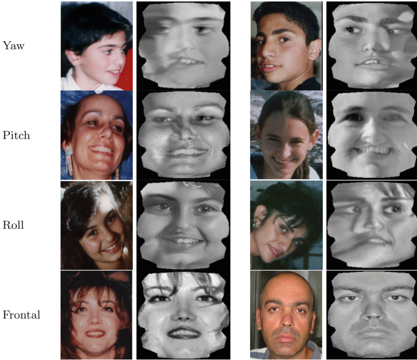
Fig. 2. Representative examples of non-frontalized and frontalized images under various initial head pose orientations. The first column indicates the dominant orientation of the non-frontalized image.

illumination changes and the pyramid provides robustness at different scales [7]. They are based on normalizing the gradient vector at each pixel and concatenating the results for both directions. From the work presented in Liu et al. [13], it is observed that frontal faces are better described using GOP features which improve the classification accuracy.